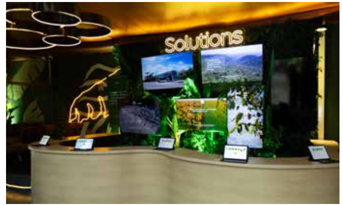
Materials developed and media results