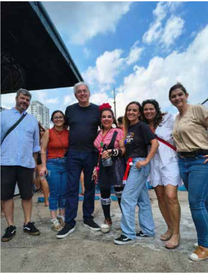
Records from the 2025 year-end celebration with members and children of Instituto EduSporte.