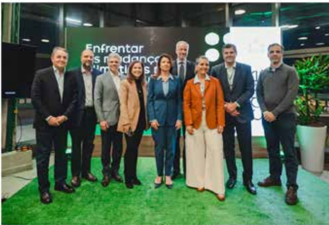
Empresas buscam visibilidade a soluções climáticas do Brasil às vésperas da COP30 | Executivos de Brasileiros, Itáia, Utilibarco, Natura, Nestlé e Vale em uma reunião conjunta para ampliar protagonismo do Brasil na agenda climática global

Brasileiros, Itáia, Utilibarco, Natura, Nestlé e Vale lançam solução conjunta para ampliar protagonismo do Brasil na agenda climática global em meio que país recebe a conferência da ONU, com objetivo de destacar soluções de apelo universal