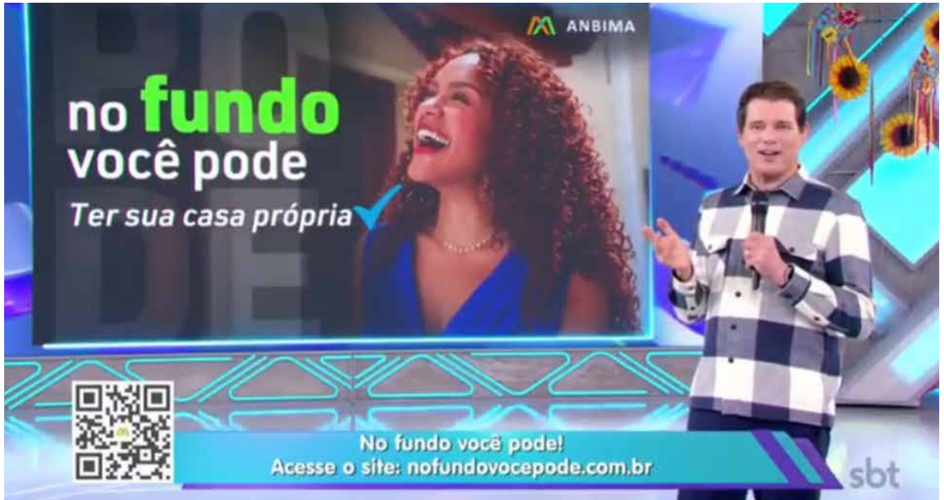
Other content and advertising materials created for the "No Fundo Você Pode" campaign.