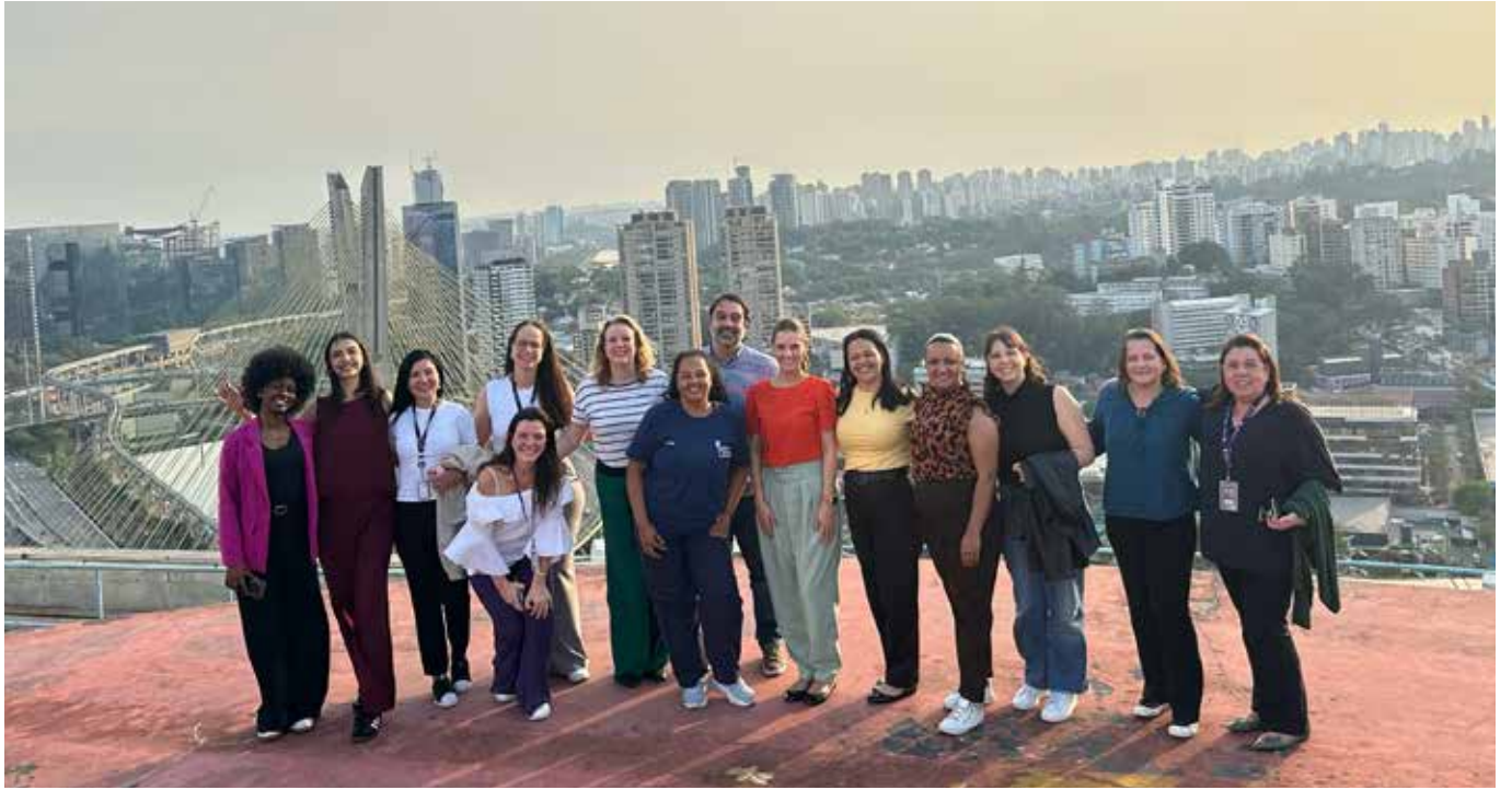
Relaxation session at height for Viatris employees, as an engagement and care initiative during the campaign.