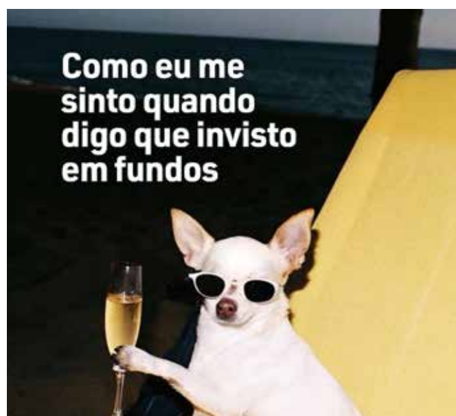
Meme created for ANBIMA Campaign

Delivery was only possible thanks to the integrated work across different fronts of Nexcom Group. The campaign brought together Fato Relevante, integrating PR, digital and planning, in collaboration with Talent and Charisma. The recognition came with the Jatobá Award, which highlighted the campaign as an example of 360° communication designed to drive cultural transformation.